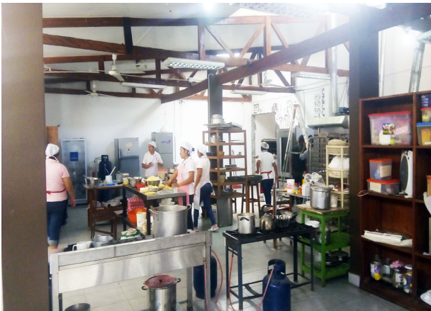
The new (temporary) production premises in the neighbouring rented arcade, at the bottom right, the door opened to connect both premises.

Thanks to the rental of the neighbouring arcades, production, which has been moved, continues in temporary laboratories during the renovation work.