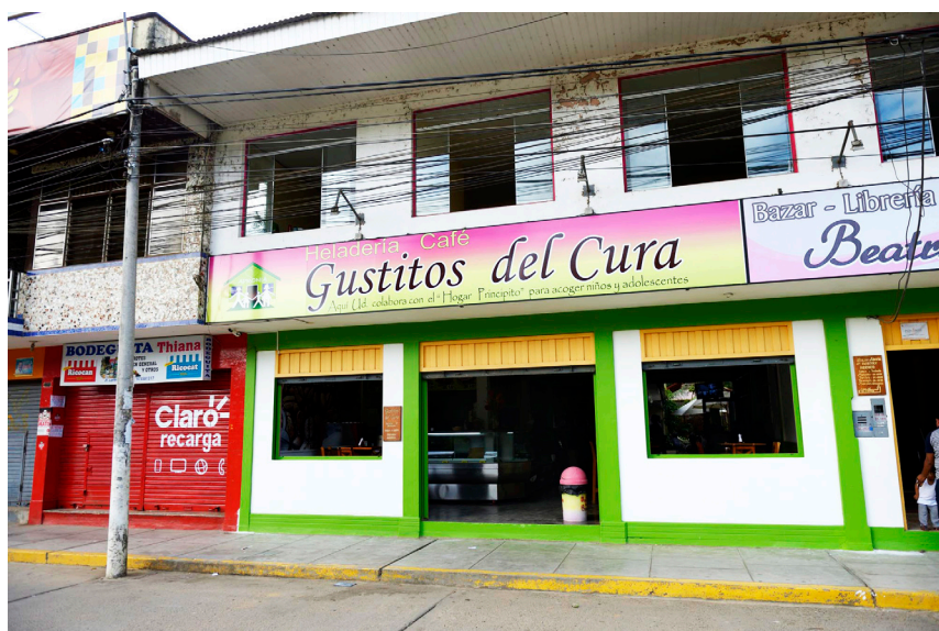
Located in the central square of Puerto Maldonado, the Apronia ice cream parlour has become a must-see meeting and tasting place for the entire city.